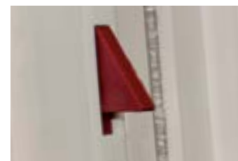
Spring-Loaded Code Compliant WOCD Option