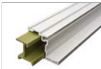
Non-metal Reinforcement at Interlock