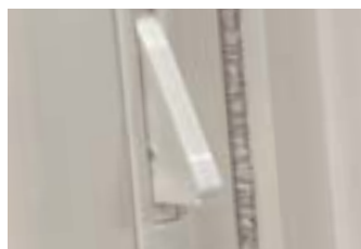
Optional Sash Vents