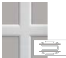
SIMULATED DIVIDED LITE (outside of glass in and out)