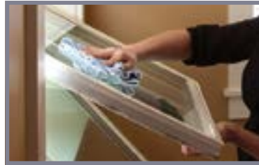
Tilt in for Easy Cleaning